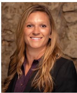
Corazón San Antonio