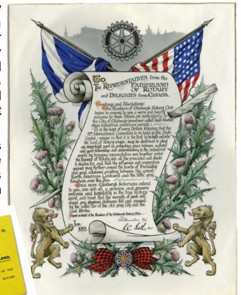
Poster welcoming attendees from the United States and Canada to the convention, and luggage tag used by convention goers traveling to Edinburgh, Scotland.